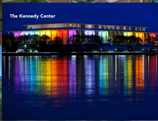
The Kennedy Center