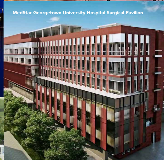
MedStar Georgetown University Hospital Surgical Pavilion