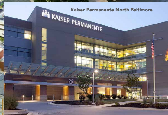
Kaiser Permanente North Baltimore