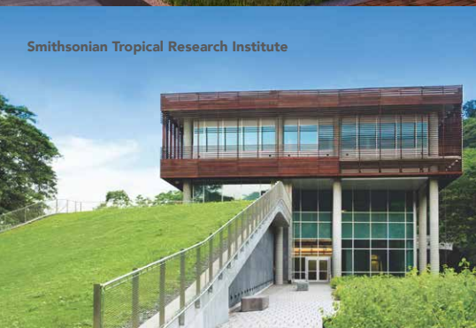
Smithsonian Tropical Research Institute