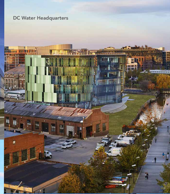
DC Water Headquarters