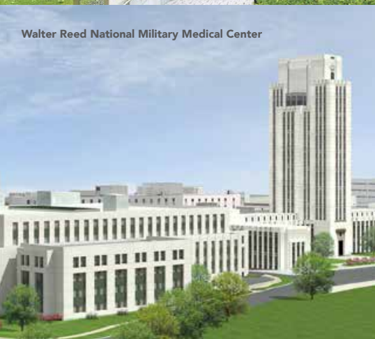
Walter Reed National Military Medical Center