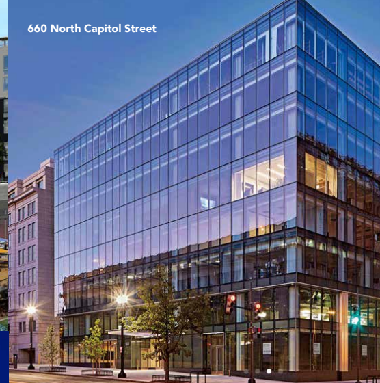
660 North Capitol Street