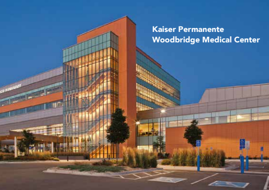
Kaiser Permanente Woodbridge Medical Center